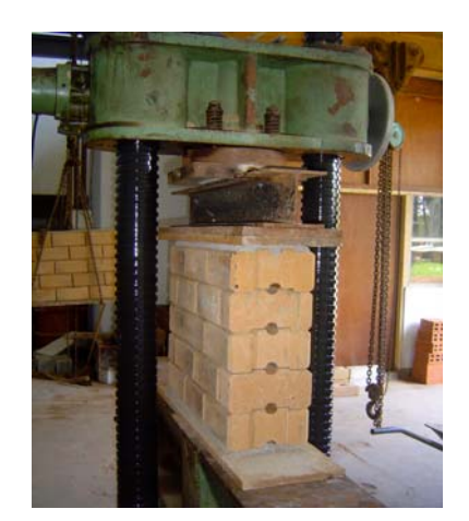
Figure 5 CSE Interlocking block panel 2 (235 mm thick wall)