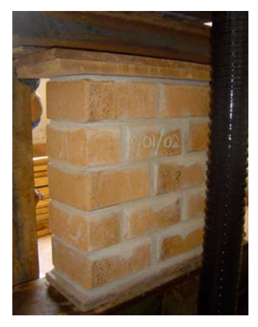
Figure 6 CSE solid plain block (235 mm thick wall)