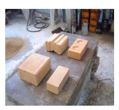
Figure 1 Block types used in the study

When thicker walls are required to carry heavier loads, solid, plain CSE blocks of 235 mm thickness can be used as an alternative to the English and Flemish bonded CSE bricks.