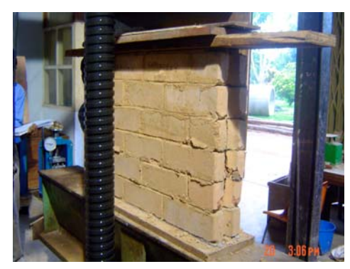
Figure 4 CSE Interlocking block panel 1-Failure pattern (145 mm thick wall)