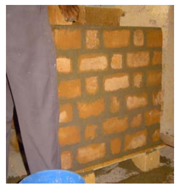
Figure 3 CSE bricks - Flemish bond