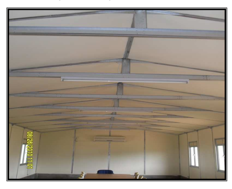
Figure 2: Arrangement of the roof used with Dura as the insulation material and steel members as the truss system.

Figure 2 shows the roof arrangement used with Dura as the insulation material and while providing structural support to the roof cladding. Steel members have been used as the truss system. One of the main drawbacks of this truss system was the high cost involved in the steel components used with the panels to produce sufficient rigidity. The advantages have been the use of light weight panels promoting modular construction that can considerably reduce the construction duration. One of the key issues of this system of single storey buildings was the durability of the panels since they could be susceptible to water absorbed especially at plinth level. For this, many precautions have to be taken during the construction of the building shown in Figure 1.