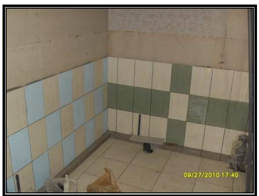
Figure 9: Bathrooms provided with a tiles to ensure proper water proofing