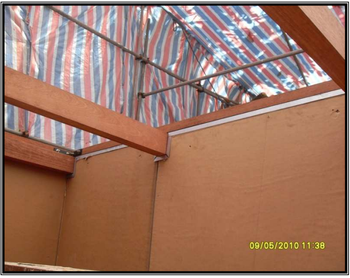
Figure 6: The beam arrangement for supporting floor slabs made by Dura panels

Figure 6 also indicates the additional timber framework that has been used to ensure proper connectivity of the timber floor beams to the Dura panels used for the upper floor. Such connectivity is important with respect to cyclone resistance. Since the two storey house is of light weight construction, it has to derive the cyclone resistance by mobilizing the rigidity provided by the panels locally coupled with the weight of the completed structure for overall stability. This two storey house has been checked as for BS 6399: Part 1: 1997 [5].