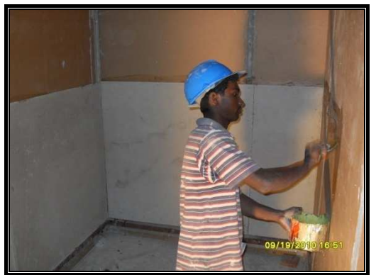
Figure 11: Additional water-proofing provided with fiber cement boards