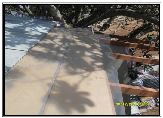
Figure 10: Roof with Dura boards supported on timber joists and also provided with a polythene sheet