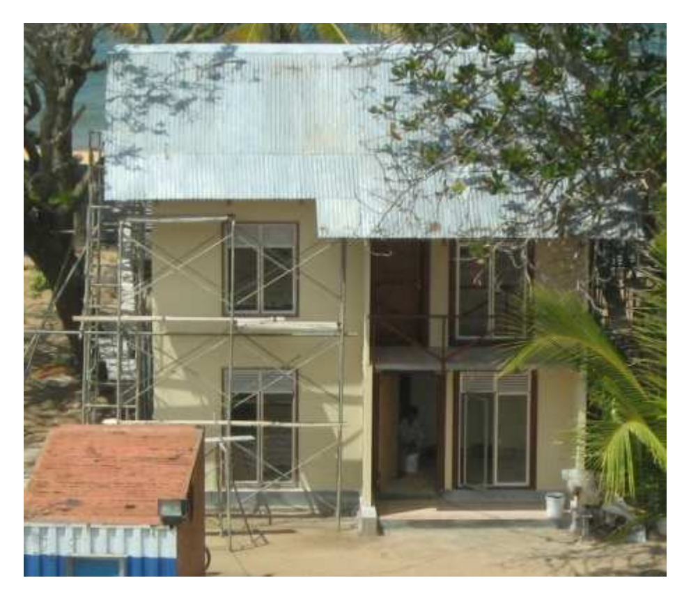
Figure 8: The two storey house under construction