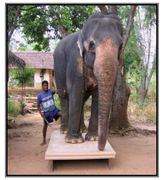
Figure 5: Dura panels were tested for larger concentrated loads

One of the main advantages of straw based solid panels is its ability to be used as floor boards supported on a suitable structural system. Generally, it is sufficient to use Figure 5 indicates the ability of "Dura" to carry structural loads, even when they are of concentrated nature. For two storey houses, a floor structure consisting of timber beams that will act in composite with Dura panels could be used as shown in Figure 6. If a greater degree of rigidity is required for the floor, it is possible to use short intermediate beams between the timber beams that would enhance the ability of floor boards to withstand point loads behaving as a two way slab system thus effectively eliminating any localized deformations. Such localized deformations could give some kind of softness under the foot of the users. Hence, its elimination could be important.