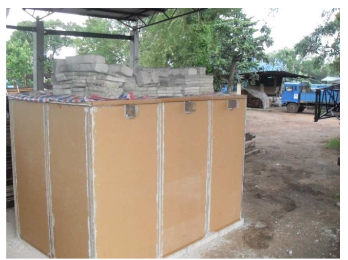
Figure 3: The load testing carried out for Dura panels with full scale model With this load testing, it was found that Dura panels could be successfully used for three applications:

There were two key issues to be resolved. One is the tendency for buckling when carrying significant loads. The other is any local failures that could occur due to bearing failures under the timber joists used to support the floor boards. Both these issues have been successfully addressed by using a full scale model that was load tested to obtain a clear understanding on the behavior of Dura panels. Figure 3 shows the loading arrangement of the model with loads and the floor joists used for supporting the floor boards. The loads applied were well in excess of the maximum load of 2.0 \text{ kN/m}^2 that can be expected in a two storey house [4].