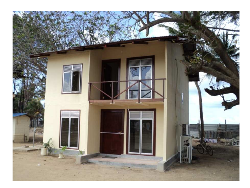
Figure 7: The two storey house that has been constructed with Dura panels being used for ground and upper floor walls, floor slabs and the insulation in roof