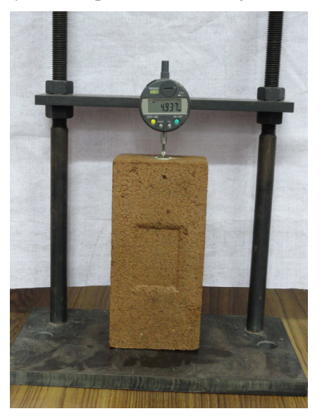
Fig. 4 – Length comparator

comparator set up fabricated in the laboratory and a brick under observation is shown in Fig. 4. Initial length of dry bricks was measured with a digital vernier. The dry bricks were first placed in the length comparator and initial reading of dial guage was recorded. The bricks were then soaked for 24 hours and again placed in the length comparator to measure the dial guage reading of saturated brick. The percentage change in length of dry bricks upon saturation is given in Table -3.