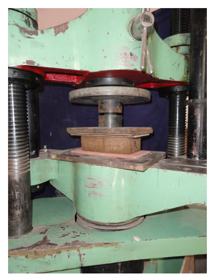
Fig. 3 – Brick under wet compressive strength test

Masonry is commonly used to take compressive loads. Hence compressive strength of masonry units is an important characteristic to be considered in selection of bricks for construction of load bearing masonry members. The bricks were tested as per IS: 3495 (Part 1) [6] guide lines in a compression testing machine as shown in Fig. 3. Satisfactory brick strength in wet condition ensures even better strength in dry condition. The results obtained are given in Table -3.