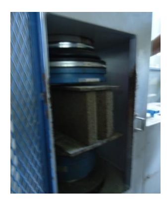
Figure 3: Concrete crushing machine

The concrete crushing machine (Figure 3) available in the Building Materials Laboratory was used to investigate the compressive strength at different age of the blocks. Conventional blocks (1:6 Cement: Sand blocks) and BA based blocks were tested at the age of 7, 14 and 28 days. For each type of blocks, three blocks were tested. Average compressive strength was determined by averaging corresponding measurements for three blocks.