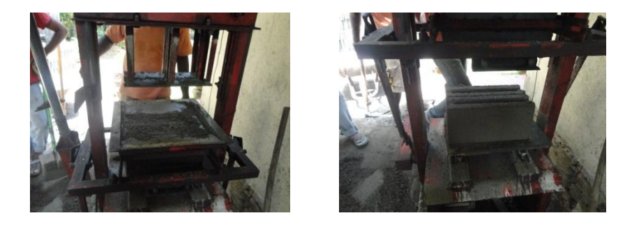
Figure 2: Block Manufacturing

Twenty four hours after manufacturing the blocks, they were continuously cured until the day of testing. Curing process was carefully done as the strength gained by the blocks depends upon the curing of the blocks. Blocks were cured by sprinkling water onto the blocks twice a day.