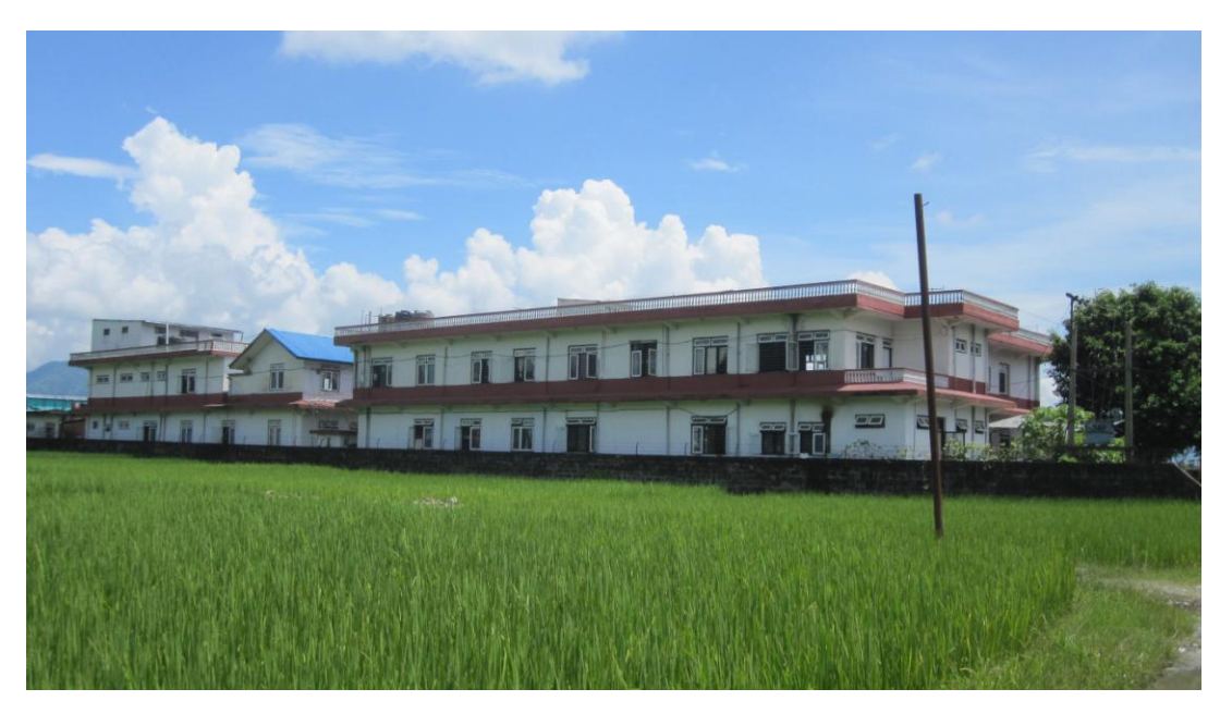
Figure 1: Jyoti Vocational Training Centre

Engineers Without Borders' Australian Chapter was formed in 2002 by a group of engineering students from Melbourne who wanted to use their skills to create lasting change through development work. The group noticed a gap in the development engineering sector — while experienced engineers were sought after for complex projects, there was a lack of opportunity for many (particularly young) engineers to become involved in grassroots humanitarian engineering. The group decided Australia needed a framework through which many more engineers, students and engineering companies could become involved in meaningful community development. Such an organisation would be more than just an overseas placement network - it would be a community of like-minded people who were inspired to learn about the issues facing the world and were prepared to strive to improve the living conditions of disadvantaged people [6].