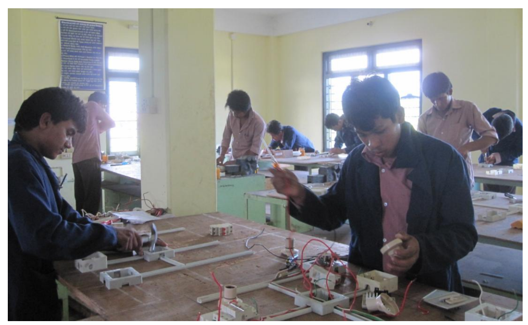
Figure 2: JVTC trainees completing a practical class in the electrical workshop

Beyond the role of a traditional training centre, JVTC also offers psycho-social support and counselling, residential services, health education and career guidance to trainees. Through this holistic approach it is hoped the trainees, almost a third of whom come to JVTC suffering from childhood trauma, can be empowered not just to find work but to constructively reintegrate into society.