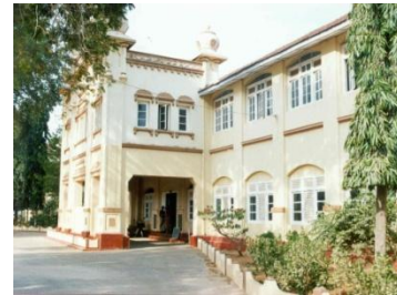
University of Jaffna

There are a number of hotels, motels, inns, resorts, hostels and B&Bs in Jaffna that cater to all kinds of travelers who come to this enchanting city. Some of the popular choices of accommodation in Jaffna are Tilko city hotel, green grass hotel, BlueHaven, Morgan's, Yarl Beach Inn, The YMCA, Ashok Hotel, Harbour View hotel, Palm Court Hotel, Bastian's Hotel, Anouk Chalet and Anouk's Swiss Chalet. there are the places as the most attractive tourist places in Jaffna were identified. But the facilitates are very poor. We must create the infrastructural structure. Such as road network, railway, telecommunication, high stars hotels, restaurants, data information system, water supply, electricity and popular accommodations with very attraction. Well plans and guidelines should be implemented for the tourism industry and regional development. Small and large tourism industries should be started to the improvement. People should be awareness about the tourism industry. Major components of potentials should be identified. The following figure show the components for the tourism industry.