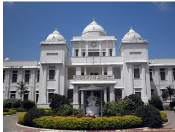
Public library of Jaffna