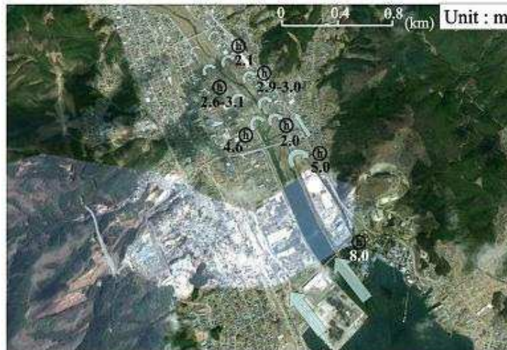
Figure 6 Damaged situation in Sakarigawa River Basin

Nakagawa, and Tonegawa Rivers had sufficient capacity to absorb the tsunami. Thus, the areas inundated by the propagated tsunami in the three rivers were restricted. Most of the tsunami intrusions occurred around branches of the river and drainage channels connected to the river. Even when a gate existed between main River and its branches, inundation was also occurred because the earthquake caused a gate trouble by an electricity failure of the system. In the Mikawa River, most of the tsunami was stopped by a sand dune on the coast, but the river itself was open to the sea and a tsunami could easily intrude into and overflow the hinterland from the river. This kind of problem in the gap of an embankment or vegetation barrier was already discussed (Mascarenhas and Jayakumar, 2008; Thuy et al., 2009; Tanaka, 2009, 2011). The river mouth problem is very difficult to mitigate because if a gate is constructed, it may change the tsunami inundation pattern, as in Omotogawa River when the tsunami exceeded the designed gate level.