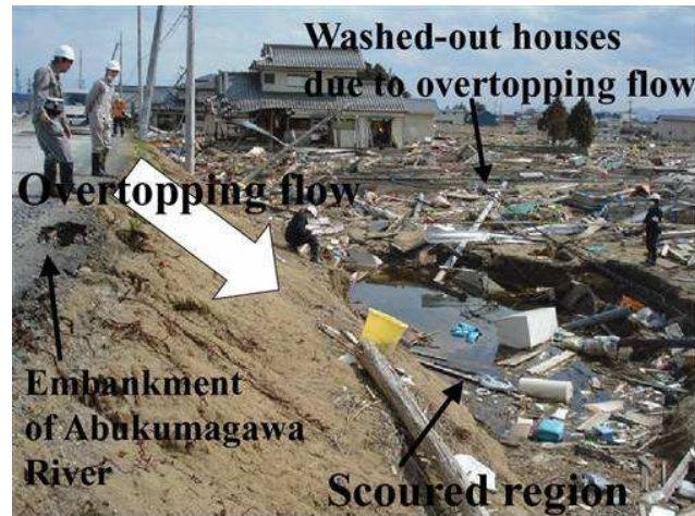
Figure 3 Large scoured region by overtopping flow (Right hand side of Abukumagawa River)