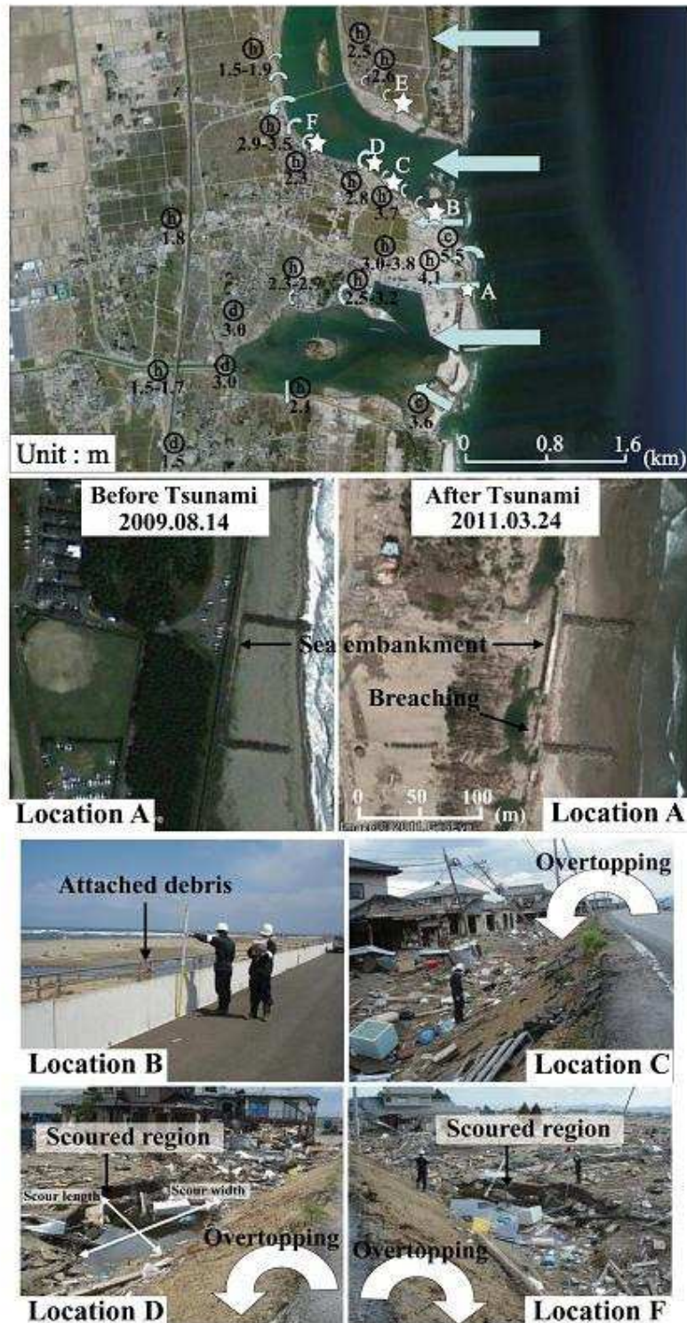
Figure 2 Damaged situation in Abukumagawa River Basin