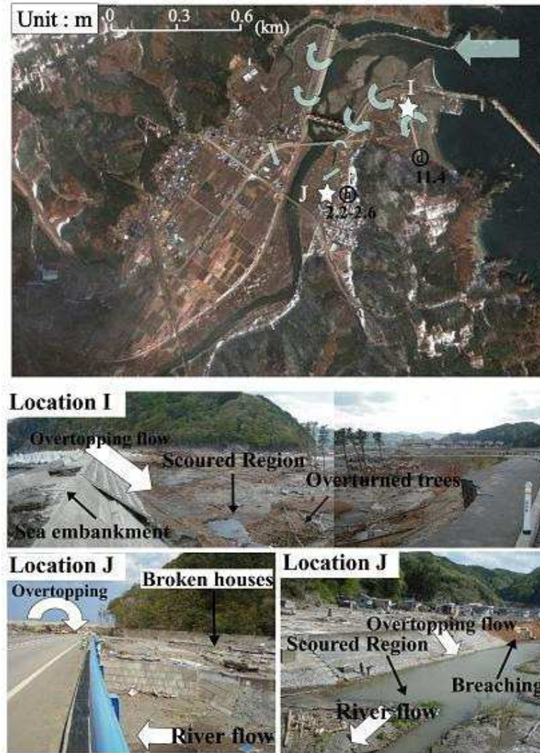
Figure 5 Damaged situation in Omotogawa River Basin

overtopping flow (Location J). From large scoured regions on floodplain of the river bed, and a scattered region of a broken parapet on the embankment, the breaching was supposed to be occurred from the inland side to the river. Even if a tsunami gate had existed, the tsunami would have been higher than the tsunami gate and the sea embankment; in fact, the tsunami inundation occurred mainly from the high embankment with high potential energy, and washed out or broke the houses. On contrary, in case of a small river in Chiba prefecture, the tsunami was stopped at the gate, because the tsunami height was low in comparison with Iwate Prefecture.