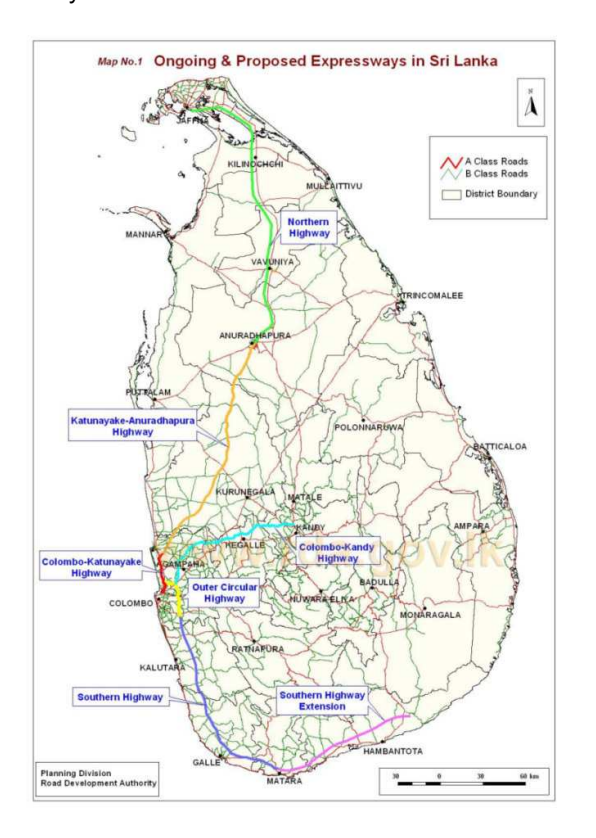
Figure 1 The expressways in Sri Lanka

For the sustaining of the industrial sector, a good road network is necessary with adequate connectivity to Colombo. It will be essential for sustaining the export sector and also supporting the service sectors like tourism. This is the link that can be considered as inadequate with the current road network that provides access to the capital city.