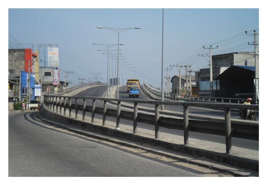
Figure 4 The completed expressway without expansion joints