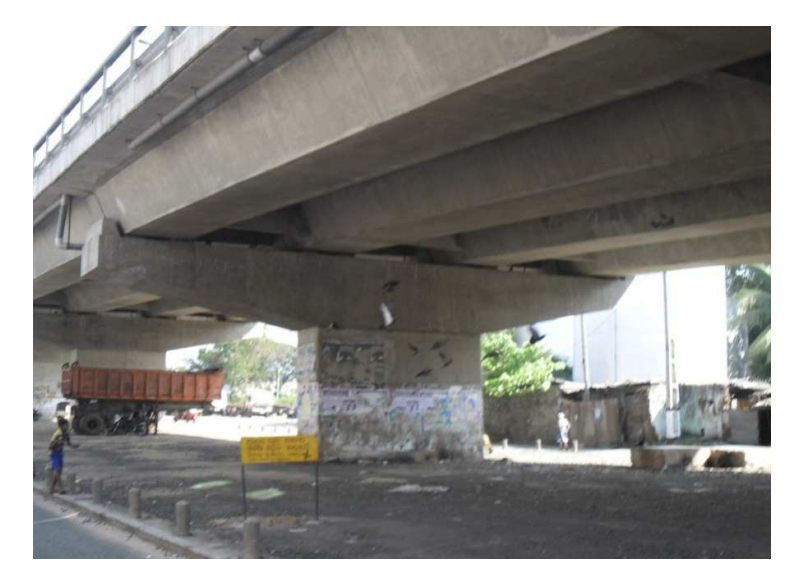
Figure 6 The completed bridge with 5.5 m cantilevers supporting the wider roadway